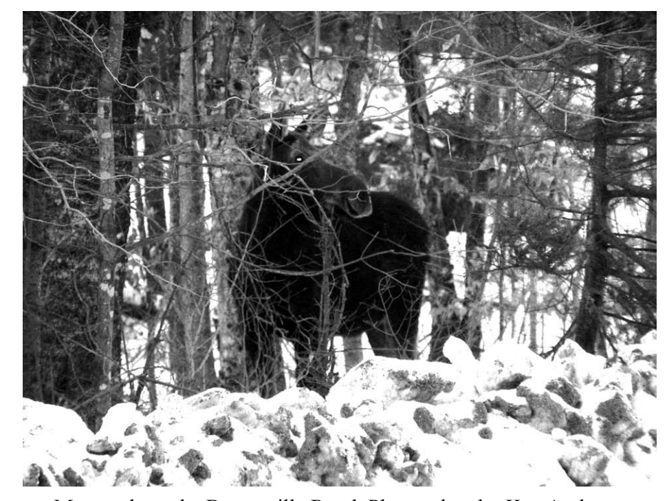
Moose along the Brownville Road.